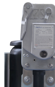
OSLA overspeed safety lock

The OSLA automatically locks the wire rope on rope breakage or overspeed descent. It must always remain fitted — the hoist cannot be operated without it, and the OSLA cannot be used on its own.