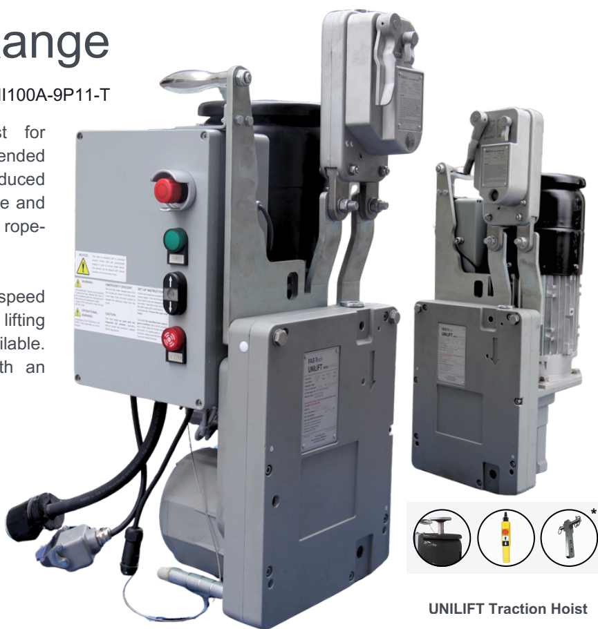
UNILIFT Traction Hoist

The rope passes through the hoist at constant speed and is not stored inside the machine, so the lifting height depends only on the length of rope available. Every unit is factory-tested and supplied with an integrated OSLA overspeed secondary brake.